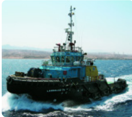
Operations in Aqaba

The Aqaba Port comprising three ports — main port, industrial port and container port — is the only maritime gateway to