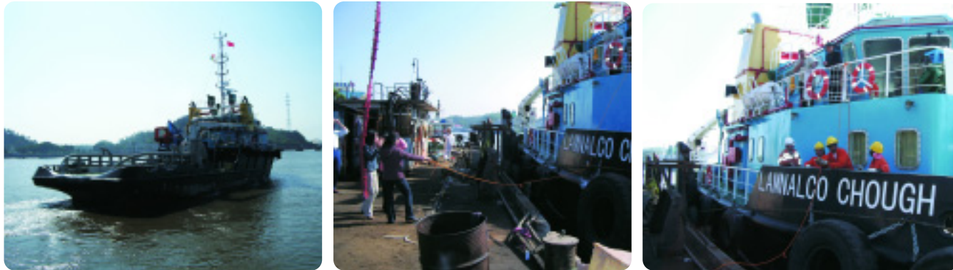
Lamnalco Chough was given a hurried but traditional send-off as it embarked on its journey to Yemen. Bon Voyage!