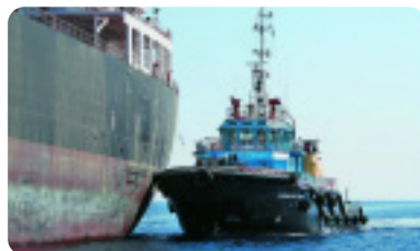
Lamnalco Tercel and Lamnalco Tern assisted in the unberthing of tanker, Ocean Skill, from the local storage tanker Jerash. The operation at the Port of Aqaba also involved berthing of the tanker, Omega Theodore, alongside the Jerash