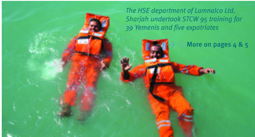
The HSE department of Lamnalco Ltd. Sharjah undertook STCW 95 training for 39 Yemenis and five expatriates