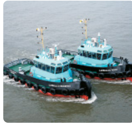
Operations in Yemen

Jordan and consequently a very busy port and of strategic importance requiring the highest calibre of marine services. Lamnalco's investment in new modern tonnage, extensive training and implementation of international best practices ensures that Aqaba Port provides world-class services to visiting ships, essential to achieve the long-term growth of this multi-modal logistics hub.