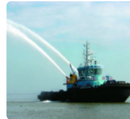
The Lamnalco Eagle represented the first long-term vessel contract with Total Elf in Nigeria.

Lamnalco now has an established presence and long-term contracts in five countries in the region, with nearly 40 vessels operating at more than 20 terminals. The company's reputation for quality, efficiency and cost-effective services continues to grow, making it the market leader in some of the company's