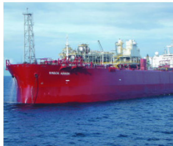
Lamnalco's vessels will provide help to tankers including the FPSO Knock Adoon (seen above) on the Antan field

Addax has turned into one of the leading independent oil companies in Nigeria through successful exploitation and technologically-led development of marginal fields. The company recently acquired the assets of Pan-Ocean in Gabon and now produces in excess of 100,000 barrels of oil per day. In addition, Addax has entered into more joint ventures in Nigeria to increase its oil and gas portfolio in the country, has commenced drilling in Northern Iraq with considerable success and will soon commence its first drilling programmes in Cameroon, and the ultra-deepwater Nigeria/Sao Tome Joint Development Zone, making it one of the first companies to commence exploration in this highly