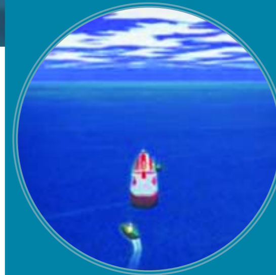
Figure 3: Stealth View: Escorting an LNG tanker

The Marin mathematical ship models are considered to be highly sophisticated manoeuvring models that are based on sea trials and model test results. Any type of vessel and propulsion system can be handled.