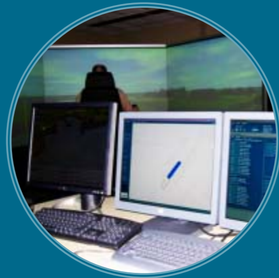
Figure 2: Instructor Operator Station