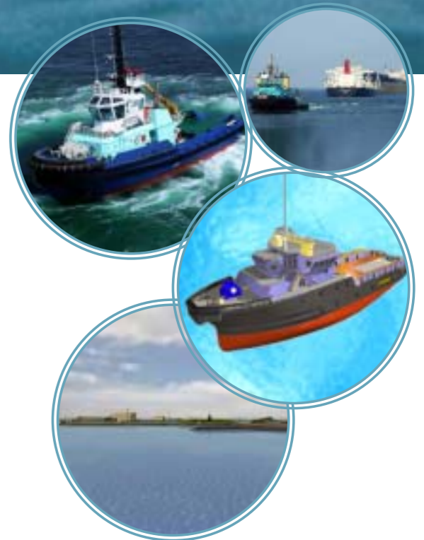
From Top Left: RA3200, C Class vessel performing tow-back duties and APS 90 Multipurpose vessel with an impression of the newest visualisation software.