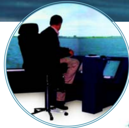
Figure 1: Trainee Station