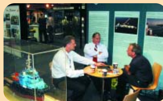
The Lamnalco stand at AOG 2007 attracted considerable interest from delegates

Lamnalco (Australia) Pty Ltd. is busy bidding for work and is optimistic of breaking ground in the near future.