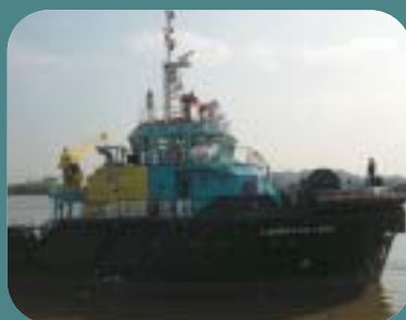
Successful sea trials and is now in full operation in Aqaba

The Lamnalco Eagle is the third Ramparts 3200 built by Lamnalco Technical Services and the second to be built by Greenbay Marine of Singapore for Lamnalco. It is a 5000 horsepower escort class tug of 65 tonne bollard pull powered by Niigata GL28HX engines and ZP41CP azimuth thrusters.