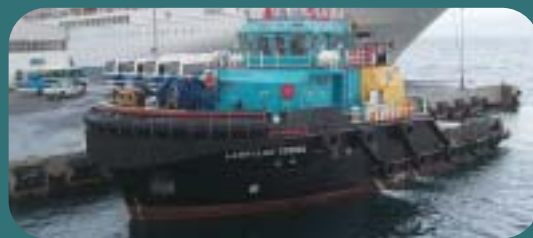
Tercel working the Thomson Celebrity