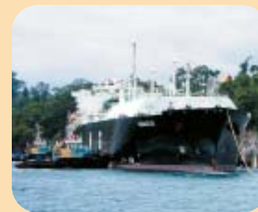
Lamnalco Teal and Lamnalco Toucan assisting the 138,000m 3 LNG carrier MT Gracilis during berthing at Punta Europa LNG Terminal