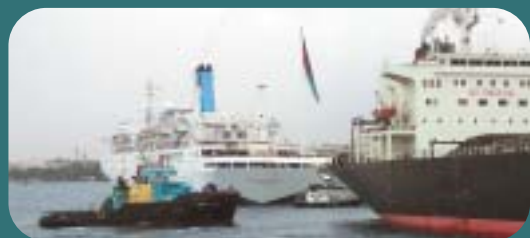
Tercel working the bulk carrier Fedra