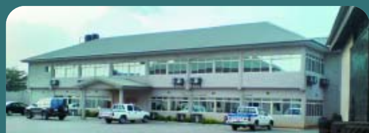
In May 2006, the Lamnalco Nigeria team moved into the purpose-built new offices located at Plot 264, Stadium Road, GRA Phase IV, Port Harcourt, Nigeria. The new offices offer a much improved and deserved working environment for the employees.